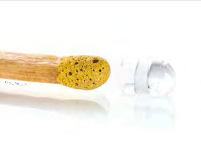
Miniature optics made of plastic: The smaller the more difficult is the manufacture of glass lenses.

glass-plastic combination will be used again," reports Bernhard Willnauer. "Mineral glasses simply offer more possibilities in imaging optics in terms of refractive index, dispersion and temperature range. But since glass cannot be ground into aspherical lenses on the scale of mobile phone lenses, a lot of research and development is currently being invested in pressing the smallest lenses".