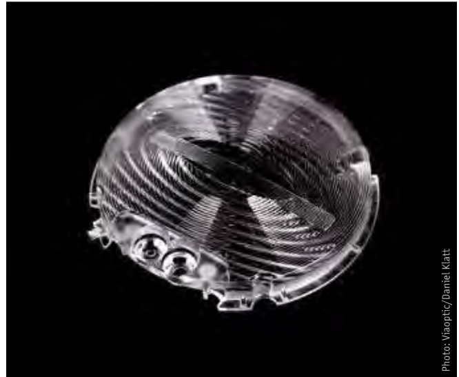
Optics for a high-end photo flash unit made of high-temperature plastic.